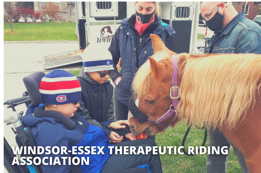
WINDSOR-ESSEX THERAPEUTIC RIDING ASSOCIATION