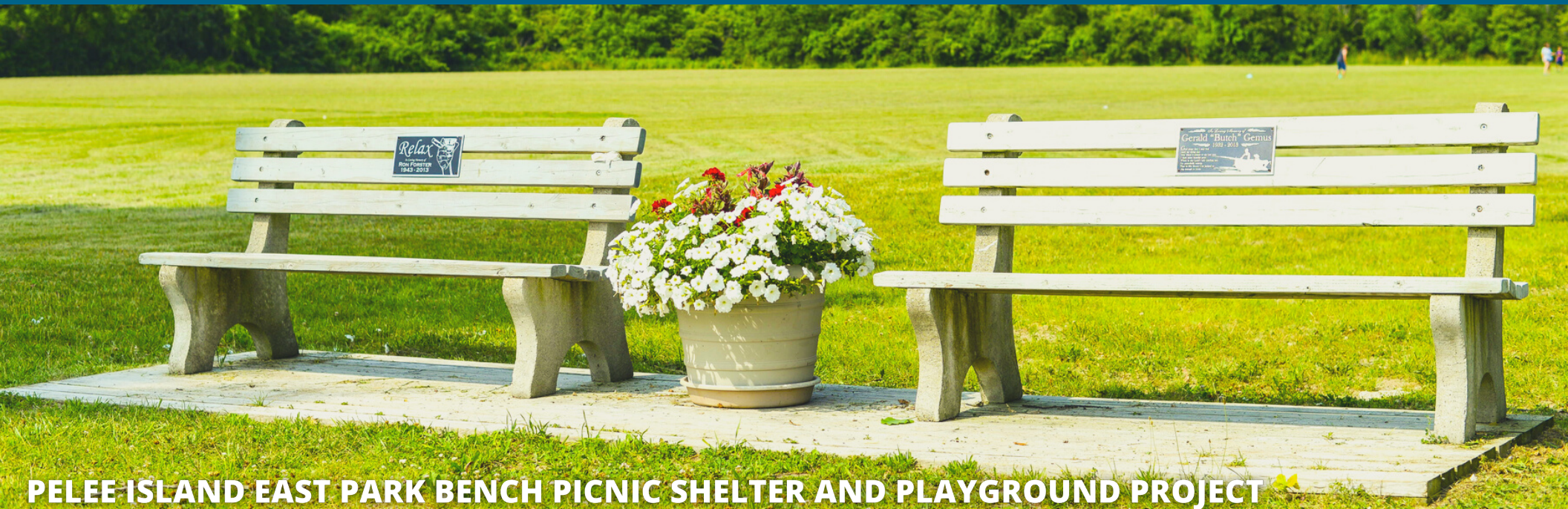
PELEE ISLAND EAST PARK BENCH PICNIC SHELTER AND PLAYGROUND PROJECT

TO BUILD A BETTER WINDSOR-ESSEX COMMUNITY BY ATTRACTING AND MANAGING LEGACY FUNDS, MAKING GRANTS TO SUPPORT LOCAL PROGRAMS, AND BRINGING COMMUNITY PARTNERS TOGETHER!