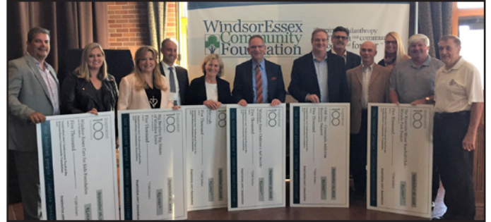
Inspiration 100™ donated $30,000 to 6 local charities.