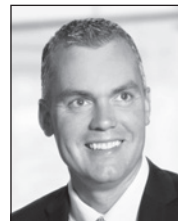
JELLE DONGA CHAIR